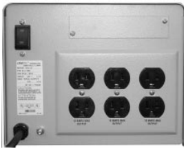
CB Series Back Panel

All CB/CC Series models are UL, cUL approved. **