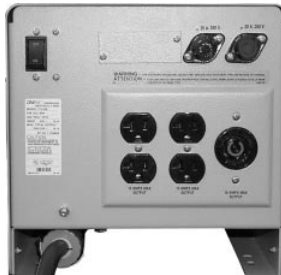
CC Series Back Panel